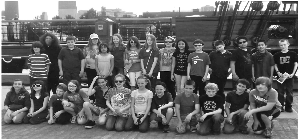
Members of Lisbon Regional School’s 5th grade class are shown next to the USS Constitution during a recent field trip to Boston funded by a grant from the school’s Education Foundation.

An example of proposals funded this year was a bus trip for the 5th Grade to Boston to visit places related to their study of the Revolutionary War. These included the Paul Revere house, the Old North Church, historic graveyards and the USS Constitution Museum.